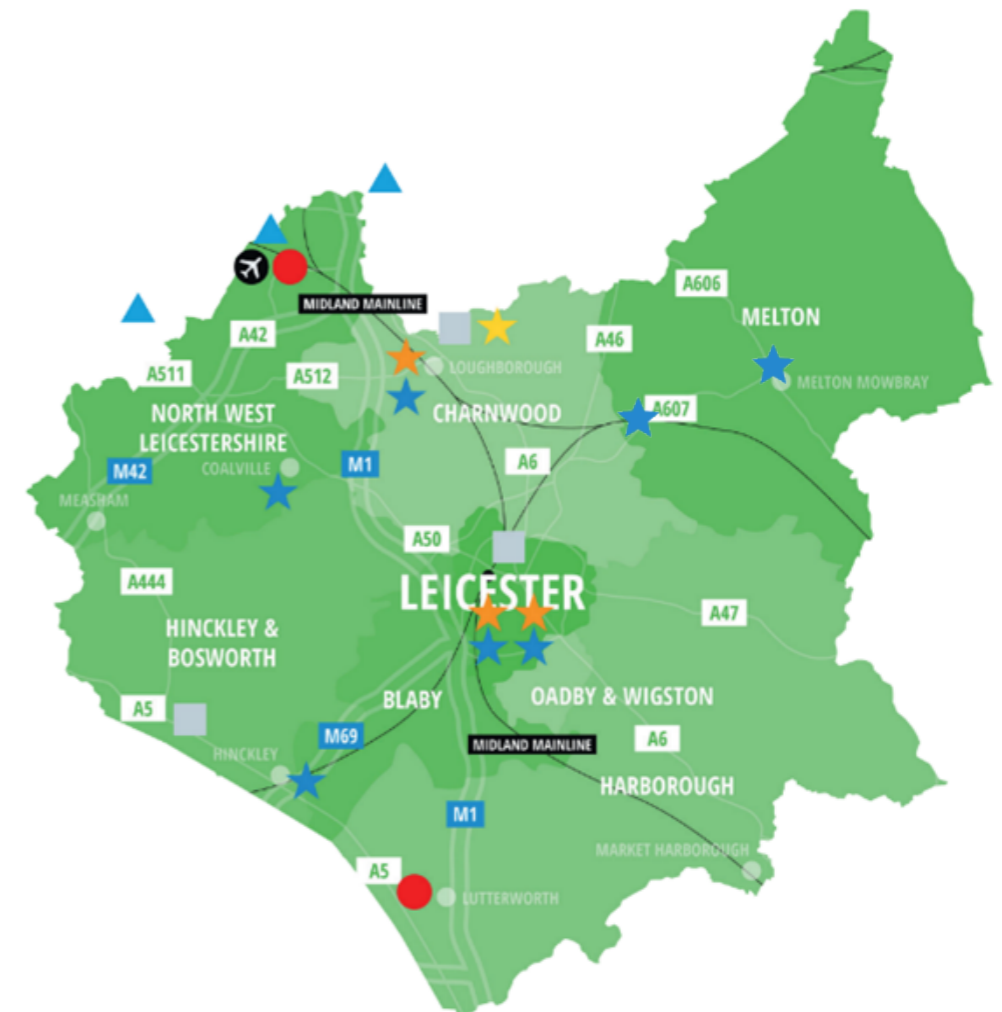
Figure 1 to the right details the LSIP geography and the key sites within it.

While this represents a significant change to local structures, the ultimate impact on delivery against the LSIP recommendations is negligible. While it is important that the work of the LSIP feeds into wider strategic decisions being taken locally, the LSIP's own governance arrangements are managed by East Midlands Chamber as the DfE-designated lead employer representative body and not impacted by any other changes.